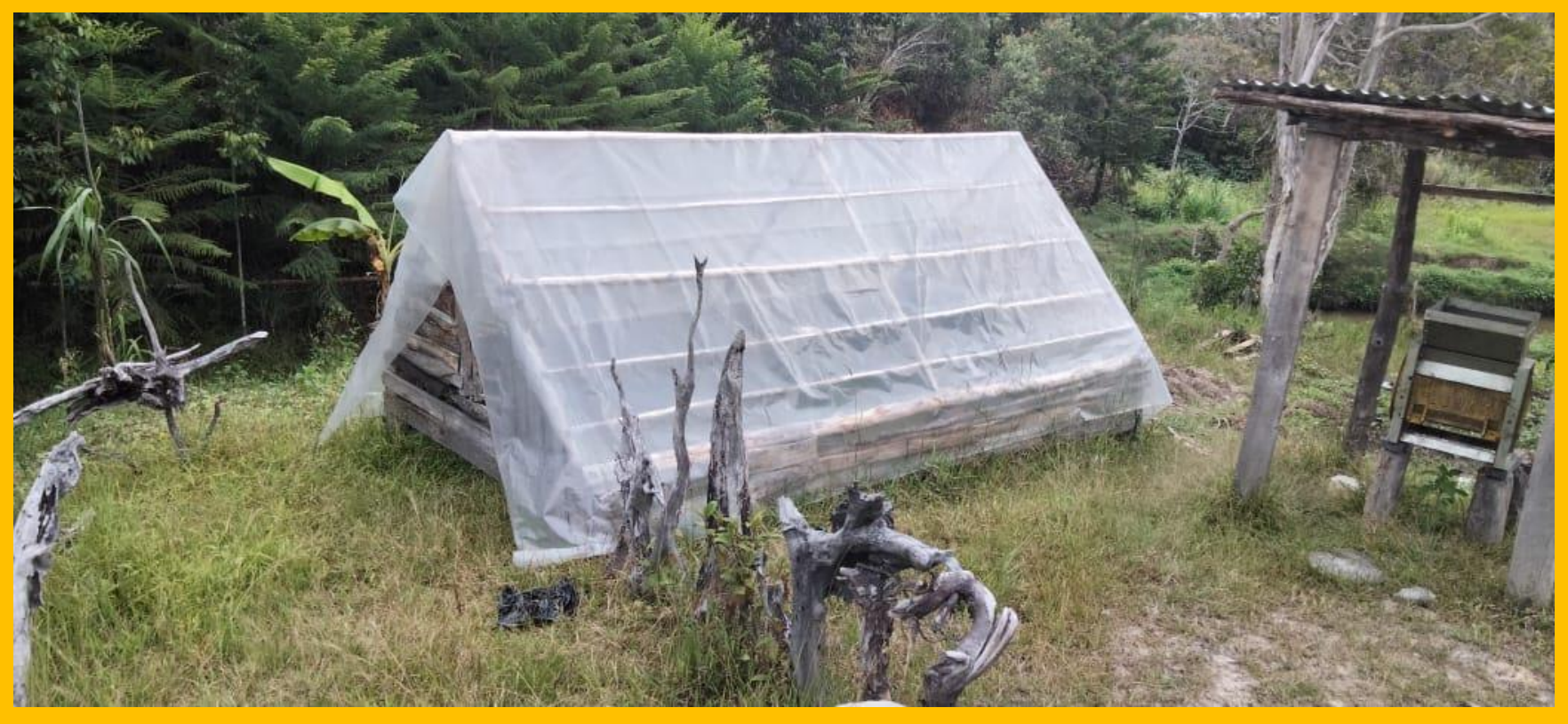
Traditional drying place for Arabica coffee (Papua Black Gold coffee) Bripi District, Jayawijaya Regency (Onggabaga Village)