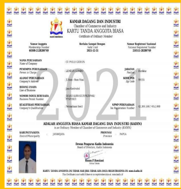
Legal Entity and Limited Trade Permit CV. PHILO GIDEON