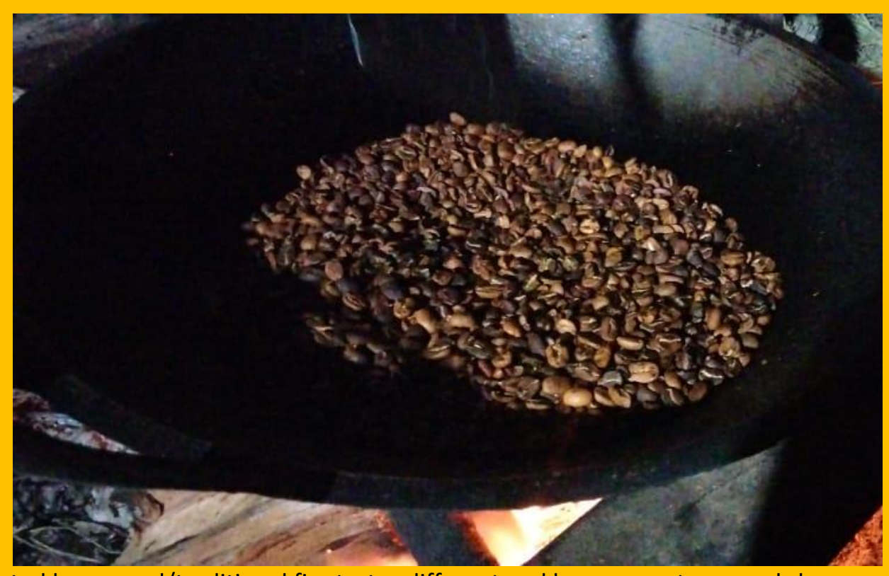
Coffee roasted by manual/traditional fire tastes different and has a very strong and sharp aroma. Coffee management process with natural process.